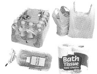
Plastic Film & Bags