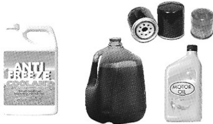
Antifreeze, Used Oil, & Oil Filters (2.5 gallon containers or smaller, no rags or debris)

Fees are associated with some of these materials to cover the cost of proper disposal.