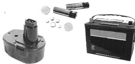
Batteries (tape terminal ends)