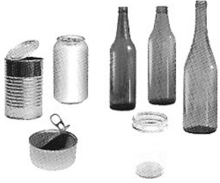
Aluminum & Steel Cans, Glass Bottles & Jars (empty & rinsed, labels can stay on)