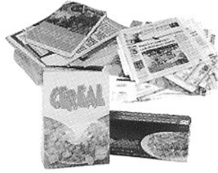
Mixed Paper, Newspaper, Magazines, & Unwanted Mail