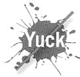
No Food or Liquid (empty all containers)