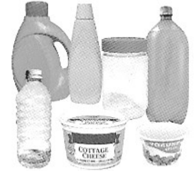
Plastic Kitchen, Laundry & Bath Containers (empty, with cap on)