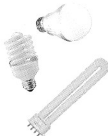
Bulbs, Lamps, & Ballasts